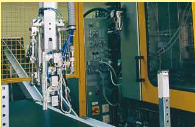
Connector at an injection moulding machine